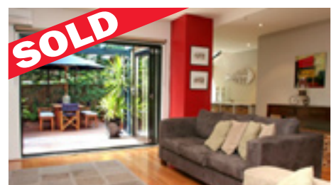
10/16 The Crescent, Avalon