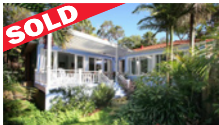
2/121 Avalon Parade, Avalon