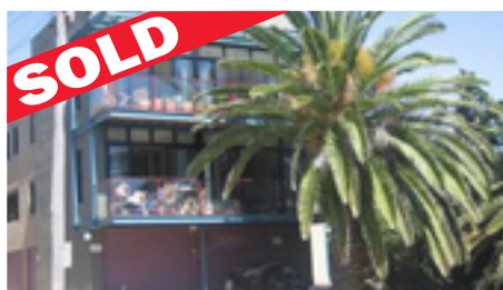
6/9 Avalon Parade, Avalon