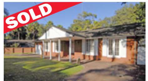
97 Avalon Parade Avalon