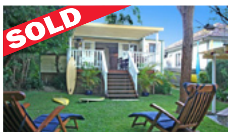
624 Barrenjoey Road, Avalon