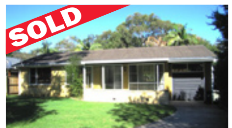
28 Burrawong Road, Avalon