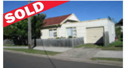
1573 Pittwater Road, Narrabeen