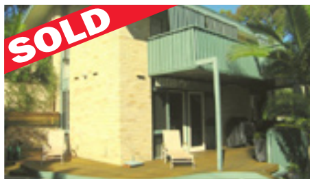
229 Lower Plateau Rd, Bilgola Plateau