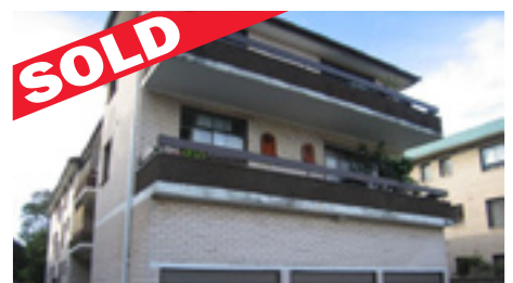
7/6 Stuart Street, Collaroy