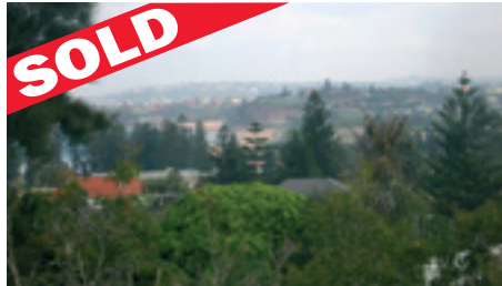
29 Hillcrest Ave, Mona Vale