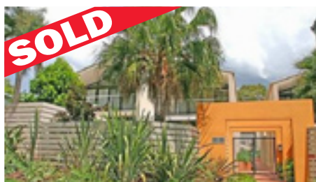
6/151 Darley Street, Mona Vale