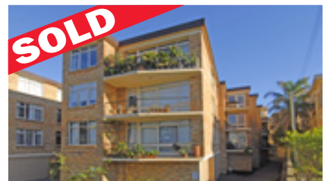
17/397-399 Barrenjoey Road, Newport