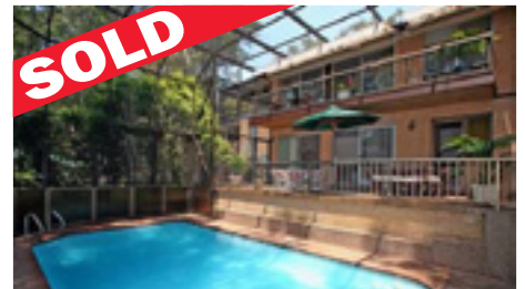
3 Gunyah Place, Avalon